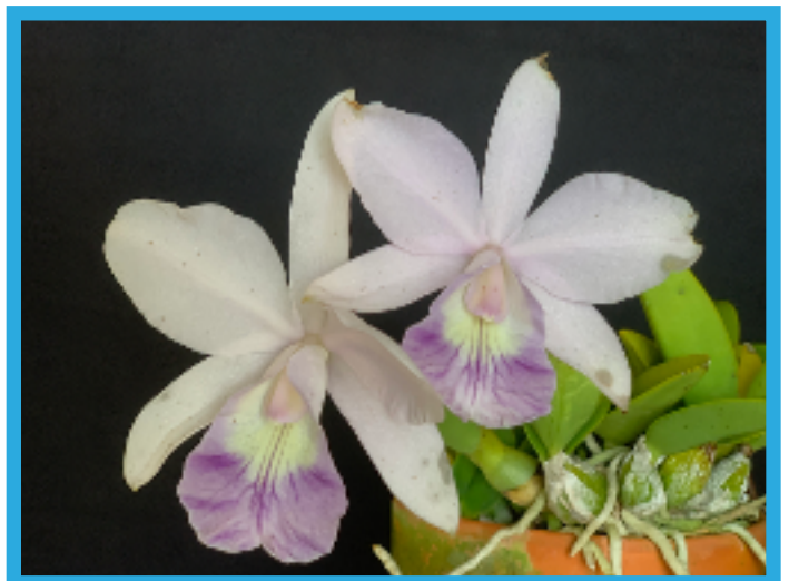
SVO6798B: Lc. Love Knot v. coerulea