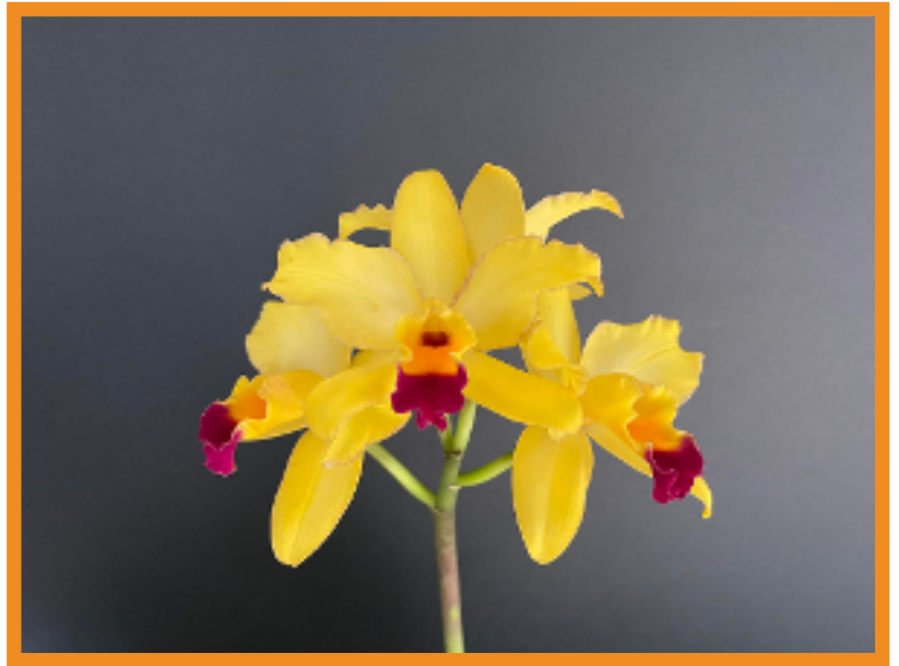
Lc. Tokyo Magic 'Moonbeam'