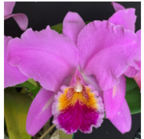
C. Mossmist 'Matriarch'