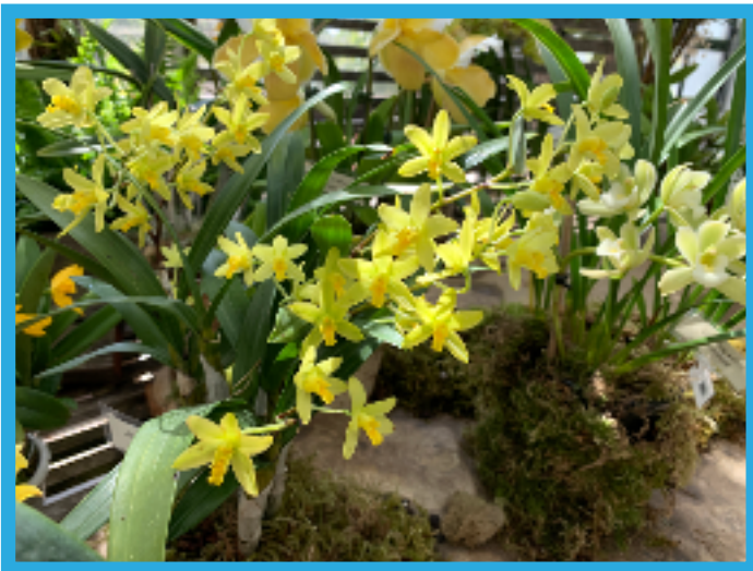
Ansellia africana 'Garden Party'