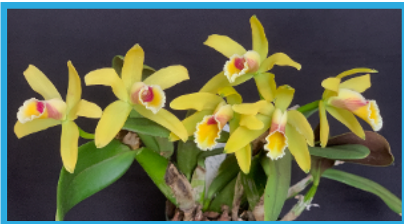
C. luteola (GC 4n x H&R)