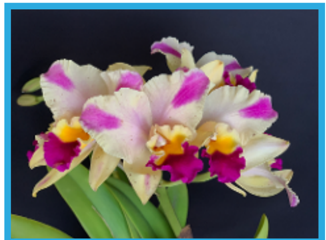
AMN-029W: Blc. Bryan Wheeler x Lc. Tokyo Magic