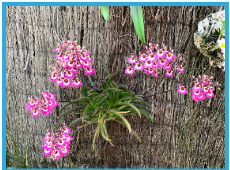
Tolumnia Pretty in Pink