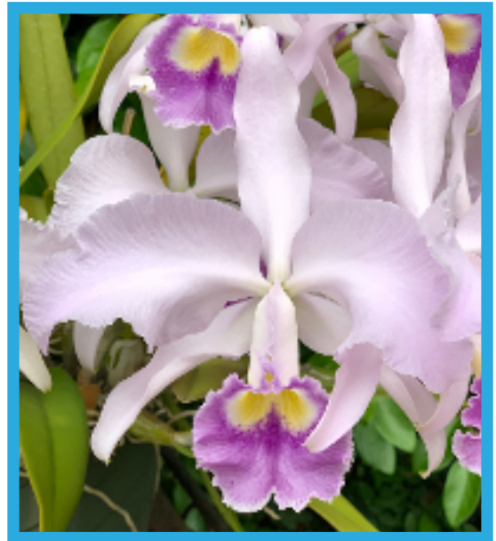
C. Lawre-Mossiae v. coerulea 'B' with close up