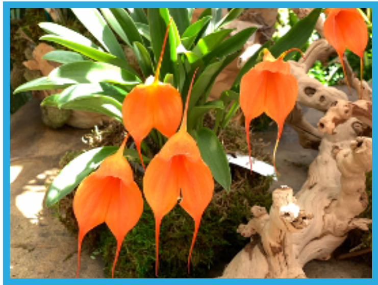
Masdevallia 'Peach Fuzz'