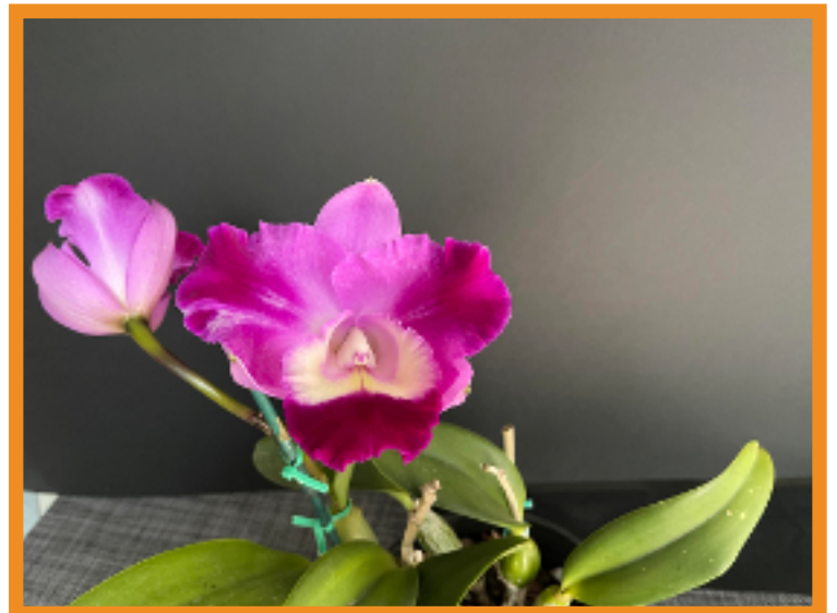
Lc. Mini Song 'Petite' AM/AOS