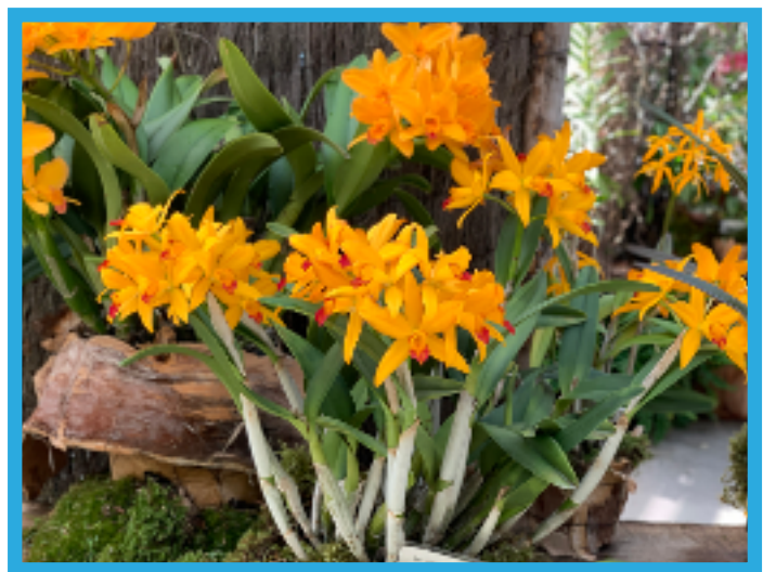
Blc. Laughing Boy