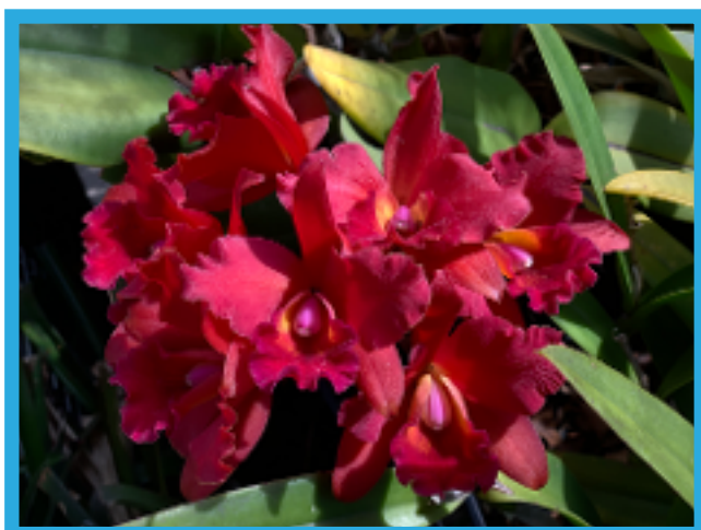
Lc. Chocoberry Fondue