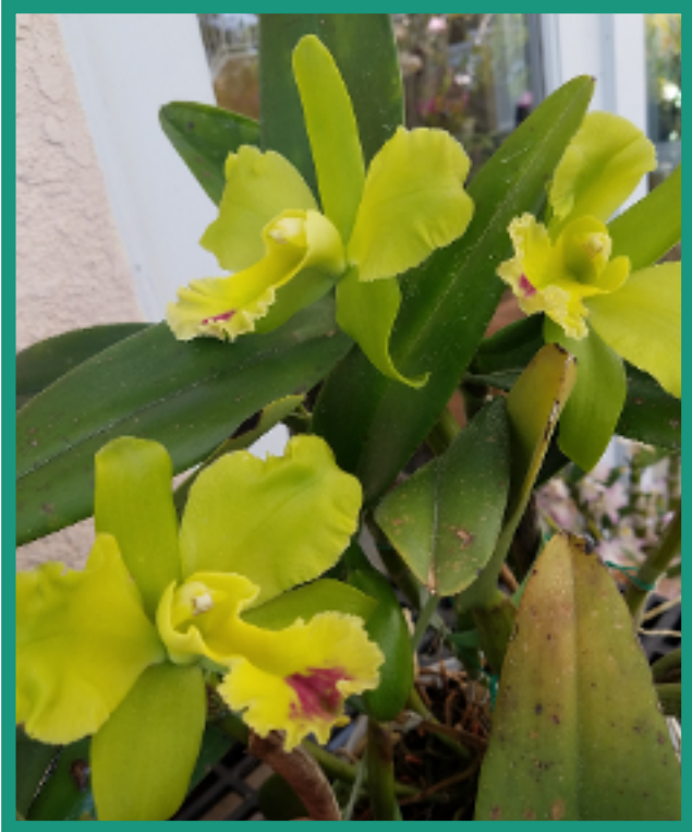
Blc. Little Mike 'Big Green'