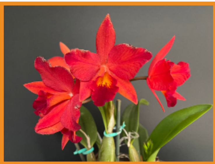
AMN-292: Slc. Circle of Life x Lc. Trick or Treat