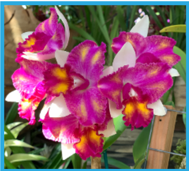
Blc. Picotee Flight 'SVO' x Slc. Mari's Vision 'SVO'